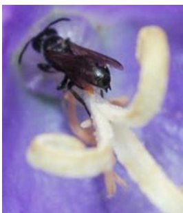
Male C. campanularum

Hymettus Ltd is the premier source of advice on the conservation of bees, wasps and ants within Great Britain and Ireland.