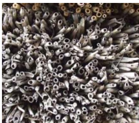
Dried reed stems - an ideal nesting site