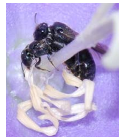
A mating pair of Chelostoma campanularum