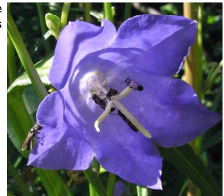
Multiple visitors to a garden Campanula