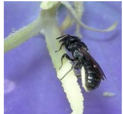
A female of C. campanularum with a full pollen load

Planting various Bellflowers and providing nesting sites (in the form of dry reed stems) can encourage the species into gardens.