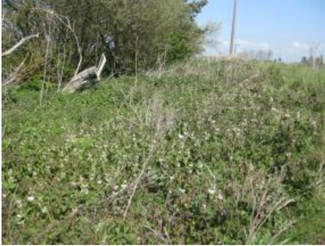
Photograph 3: White dead nettle pollen collection site, Romney Marsh visitor centre

On return from Sweden further pollen was collected from bumblebees visiting red clover, Trefoilum pratense , tufted vetch, Vicia cracca , meadow vetchling, Lathyrus pratensis and other species on which B. subterraneus is known to feed. Ideally 90 grams of pollen would have been collected but due to poor weather conditions only 15 grams is available for next year's queens. However, pollen collection will begin again in April in the UK and continue until last flowering in September.