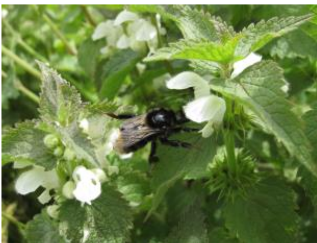
Photograph 7: Released B. subterraneus queen