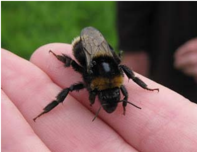
Photograph 6: Short-haired bumblebee queen to be released