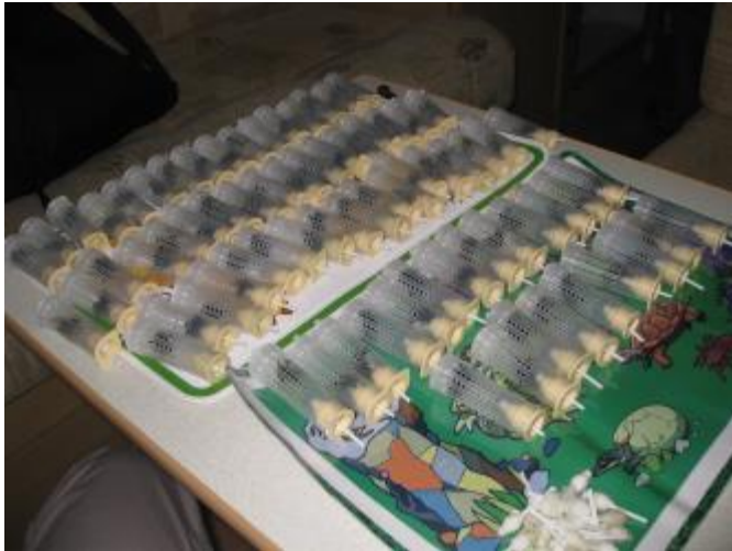
Photograph 1: Feeding queens of B. subterraneus