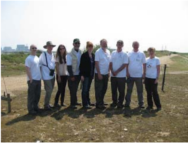
Photograph 5: Project officer and volunteers at Dungeness reserve

farmers, project volunteers, project supporters and charities. Fifty one queens were released.