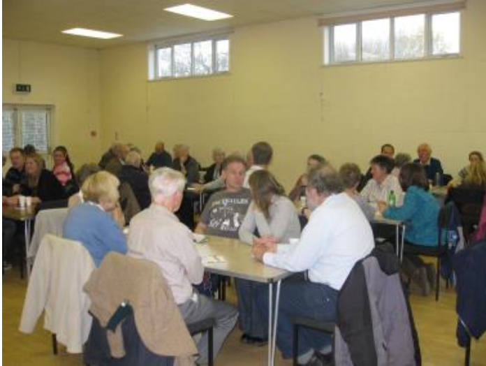
Photograph 12: 2012 bumblebee quiz afternoon