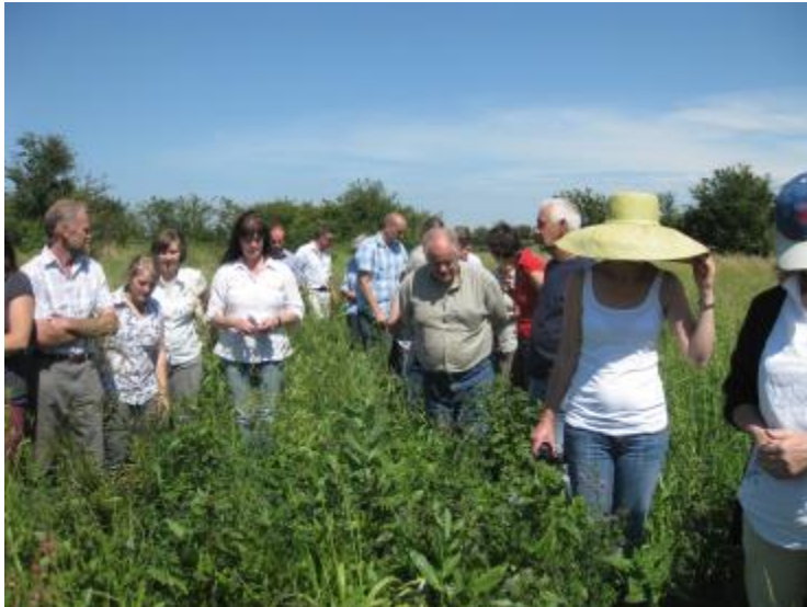
Photograph 8: Bumblebee farm day event, Shirley Moor Farm

A bumblebee farm day event was held at Brian Neal's Shirley Moor farm on the 5 th July. The event was well attended by 16 farmers, Natural England, RSPB, BBCT, FWAG advisors and Kent Wildlife Trust. Farmers were invited from around the Woodchurch and North Romney Marsh area. All attendees are asked for their name and contact details so that the project officer can arrange visits through the summer.