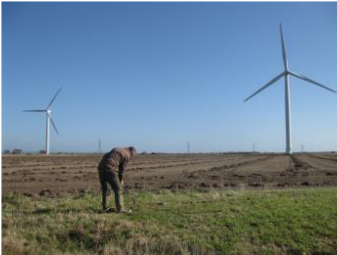
Photograph 11: Volunteer Nick Withers planting comfrey at Little Cheyne Court wind farm

The project officer approached Little Cheyne Court to resow wild flower seed under some of the wind turbines. A visit took place and NPower agreed to spray around and under some of the turbines where grasses were encroaching on the cultivated mix. This was delayed by the continuous rain but spraying is due end of March and resowing complete by end of April 2013. The project will also use the donated seed, purchased yellow rattle seed. Comfrey and white dead nettle plants were planted out last Autumn with more to be planted in later in 2013.