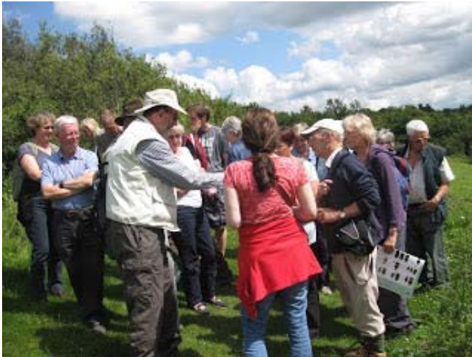
Photograph 10: Kent Wildlife Trust bumblebee ID day

Wildwood. The project regularly attends Kent Wildlife Trust events and maintains a good working relationship.